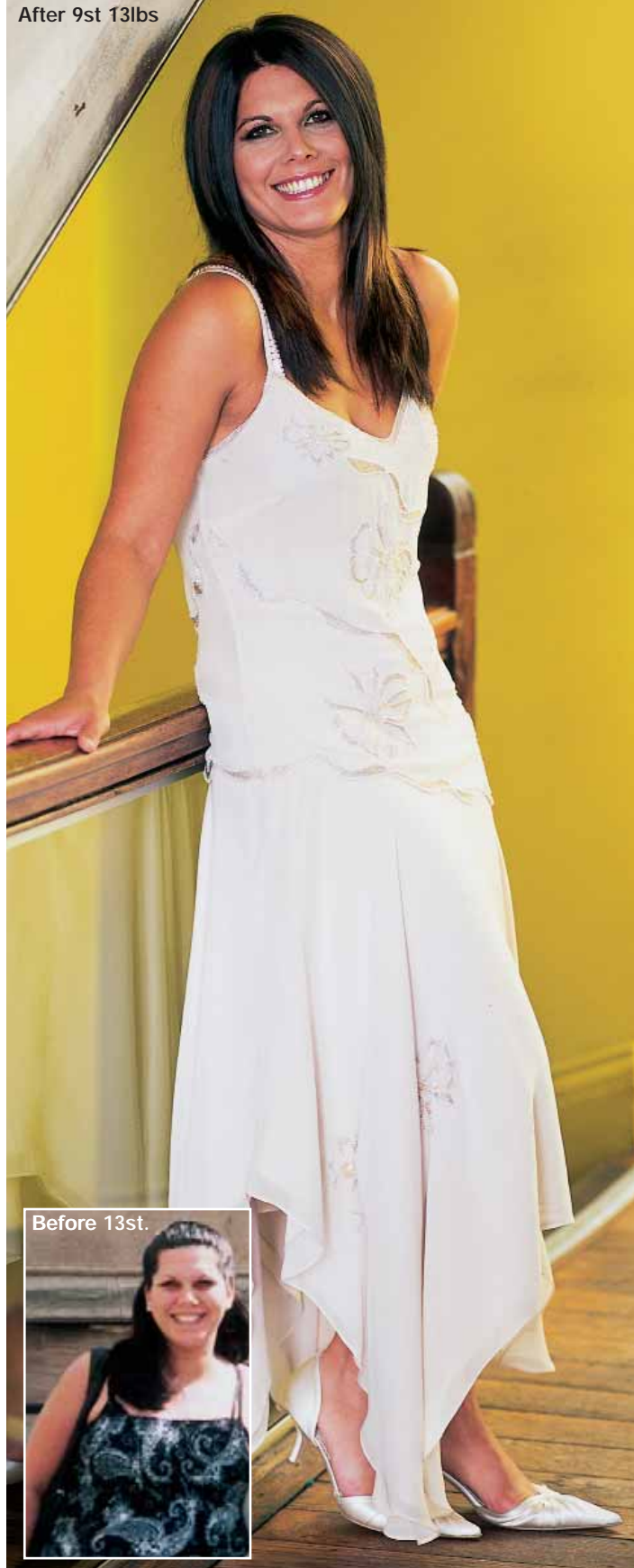
After 9st 13lbs

FOR INFORMATION ON SLIM-AT-HOME OR PRIVATE CLINICS, CALL VITALINE ON 0161 292 4918. Internet slimmers can visit www.vitaline-slimming.com Ladies with PCOS can visit www.pcos-vitaline.com